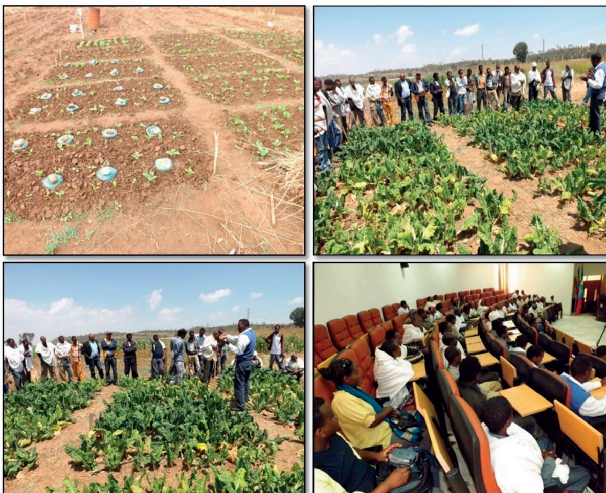
Figure 1. Images showing the demonstration of the project in Africa.

The interactive training and demonstrations delivered to university students, farmers and extension agents have contributed to enhancement of knowledge of using clay pot technology, which has contributed to enhance food productivity in dryland areas of Ethiopia. Cooperation in scientific knowledge sharing and development of partnerships with Brazilian Embrapa scientists has also been enhanced.