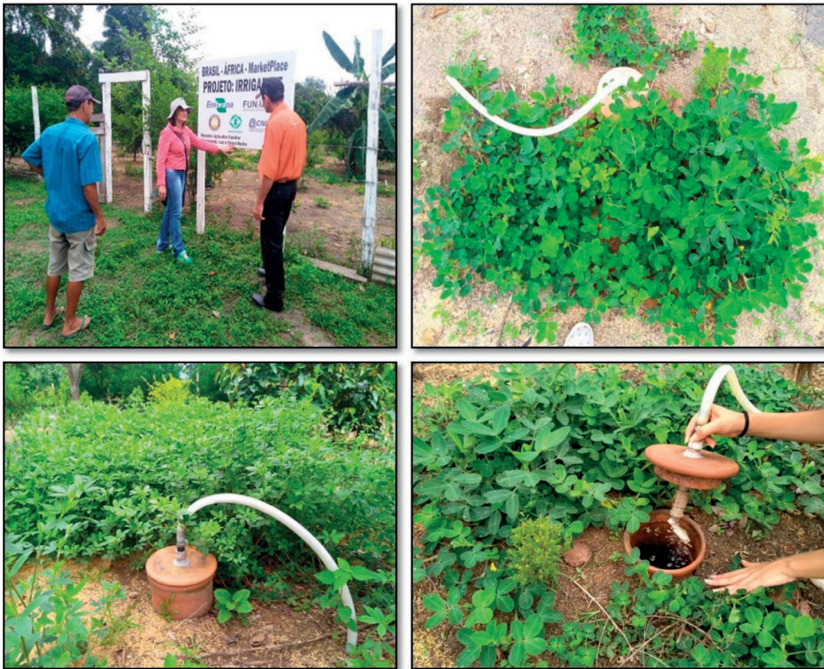
Figure 2. Images showing the experiments installed in the Amazon sharing knowledge obtained from the Brazil partnership.